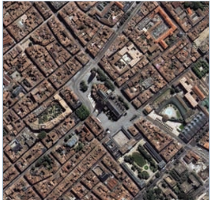
Cathedral of St. André, Bordeaux, France May 20, 2009

Higher resolution multispectral satellites with traditional visible to near infrared (VNIR) bands are increasingly able to discern fine scale features. With spatial resolutions of 0.5-1 meter, these satellites have consistently demonstrated the ability to classify features at the third level, for example, discriminating between grasses vs. trees in an orchard, segmenting urban areas by housing types, and discriminating between paved and unpaved roads.