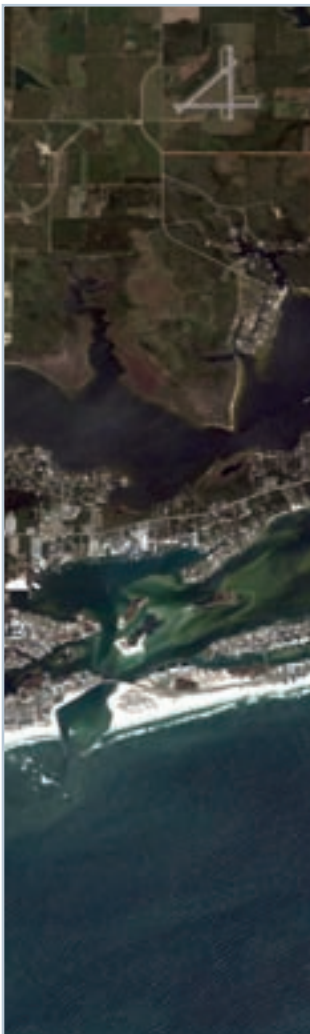
Orange Beach, Alabama September 24, 2008

Current, accurate and easily updatable bathymetric models will be an effective tool for gaining a clearer understanding of the world's waterways, and improving the safety of marine navigation.