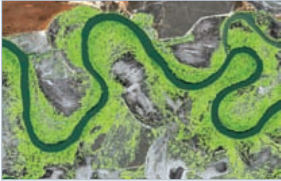
River Vegetation Mapping

Highly detailed and comprehensive multispectral data is empowering feature classification and extraction analyses that bridge the gap between scientific studies and practical applications.