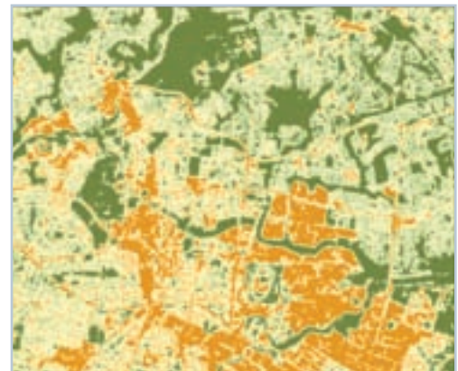
Urban Land Use Density

WorldView-2 enables agencies to synoptically map an entire urban area, and with increasingly automated feature extraction and classification capabilities, derive actionable information for managing scarce resources. Through a combination of spectral signatures and objected oriented methodologies, roads can be extracted and even classified by when they will need resurfacing. Storm water management fees, based on changes to the amount of impermeable surfaces, can be accurately measured, and properly assessed without the need for expensive ground-based surveying projects. Spectral changes in urban areas can also indicate construction projects such as the addition of sheds, decks and other outdoor structures that may not be properly permitted.