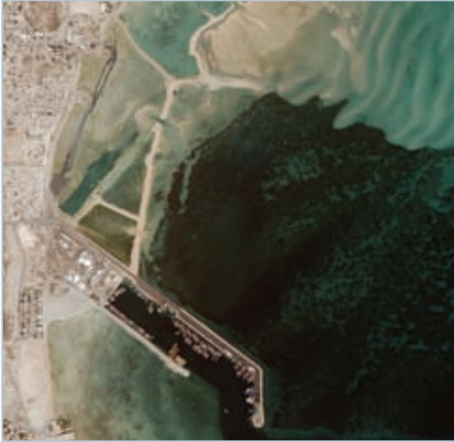
Al Wakrah Port, Qatar April 5, 2009

Analysts have leveraged existing multispectral satellites' ability to detect light in the blue (450 – 510 nm), green (510 – 580 nm) and red bands (630 – 690 nm) to achieve good depth estimates, in water up to 15 meters in depth. And, with the addition of sonar based ground truth measurements, they have achieved vertical and horizontal accuracies of less than 1 meter.