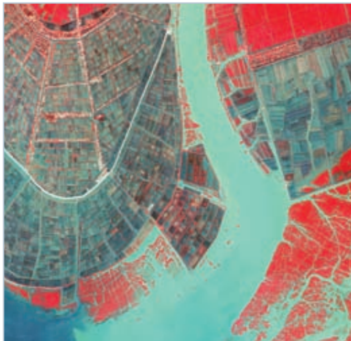
Red River, Vietnam September 23, 2007

Until now, the only satellite imagery available that contains Red-Edge data is medium to low resolution (5-30 m). It can provide some insights into the conditions of an entire field, but is unable to provide the segmentation necessary to evaluate small scale details, like the health of individual trees in an orchard, or map the impact of irrigation and fertilization within a field.