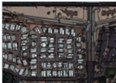
Converting to Objects