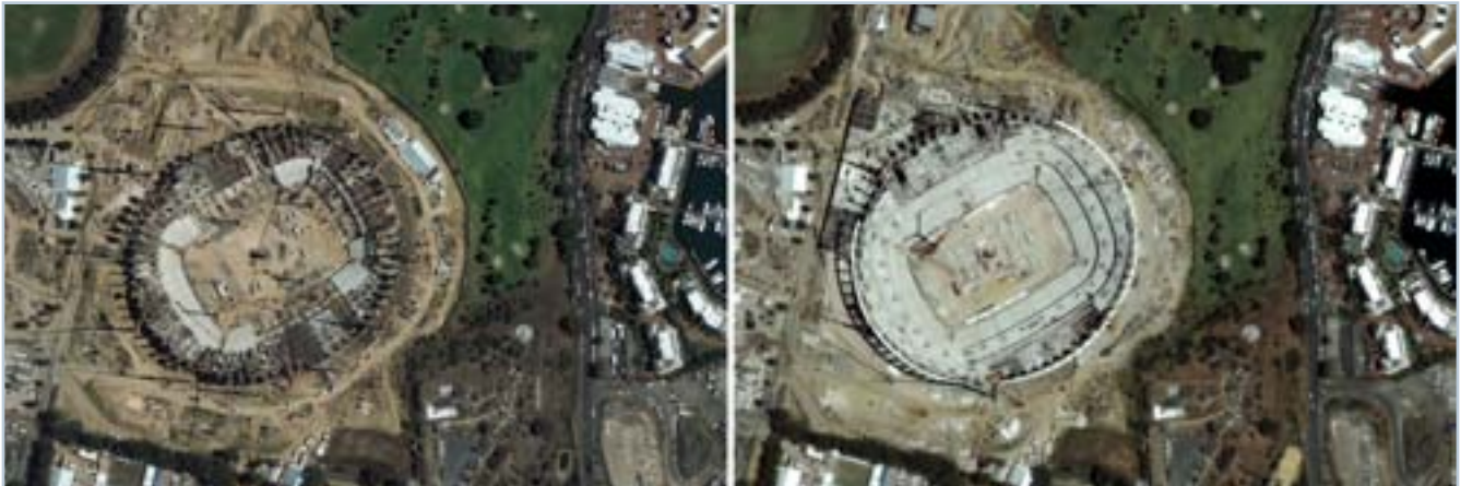
Capetown, South Africa March 5, 2008

valuable in understanding and reacting to change. WorldView-2's 8 spectral bands, 46 cm* panchromatic and 1.8 m multispectral resolution are able to reveal significantly more detail in the spectral changes of small ground features. Measuring the changes in road conditions, or the health of plants over an underground gas pipeline or the new location of a sandbar requires sensitivity that only WorldView-2 can provide. Increased sensitivity, however, is only part of the story. With WorldView-2's immense collection capacity and rapid revisit capabilities, large areas can be repeatedly imaged, providing the data necessary to conduct automated change detection.